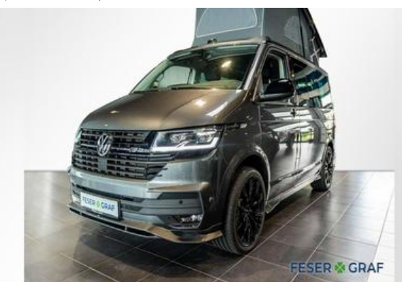
FESER 😵 GRAF